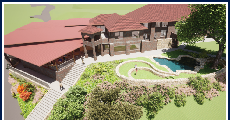
More pics overleaf...