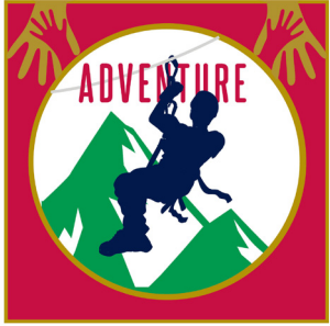
Stanford Lake College's ROUND SQUARE CONFERENCE

Stanford Lake College ISSUE 07 of 2022 - 03 March