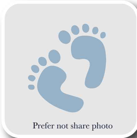
Nyasha & Itumeleng Lebea welcomed Isheanesu Leonel Lebea on 30 April 2019 (Nyasha Chitate, class of 2010)