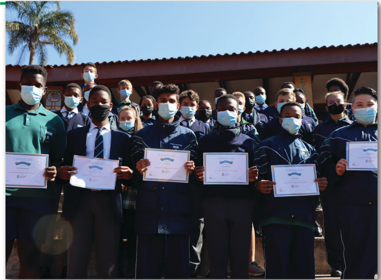
Grade 10 Allan Gray participants.