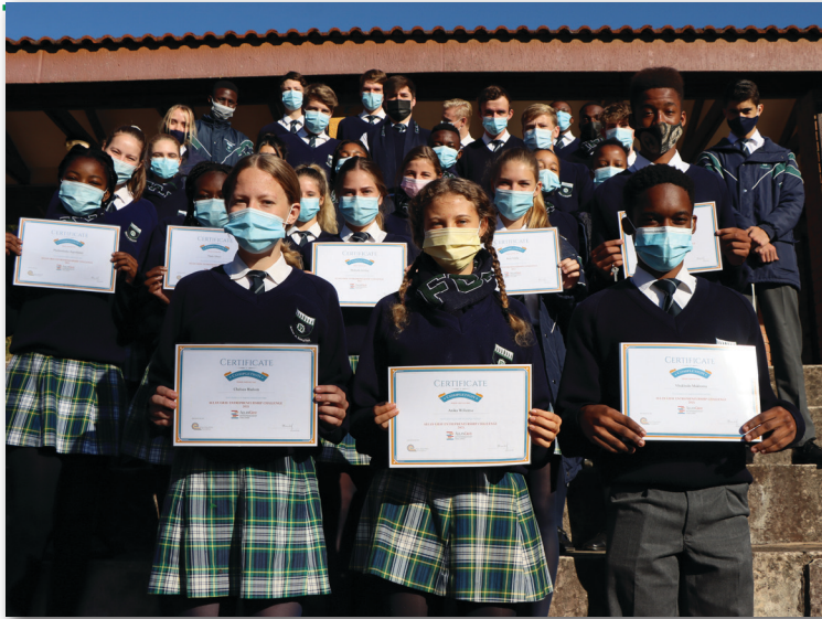
Grade 11 Allan Gray participants.