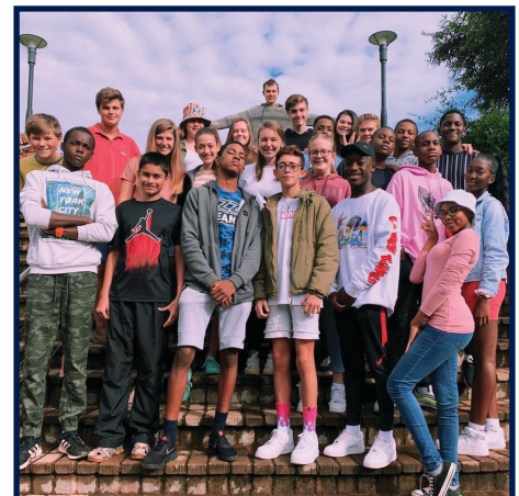
CATEGORY: My Stanford Life WINNERS: Grade 9