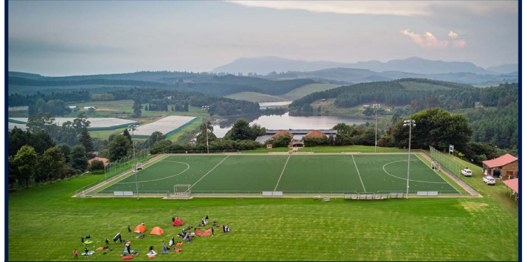
Grade 8s on their sleep out on the field on Tuesday