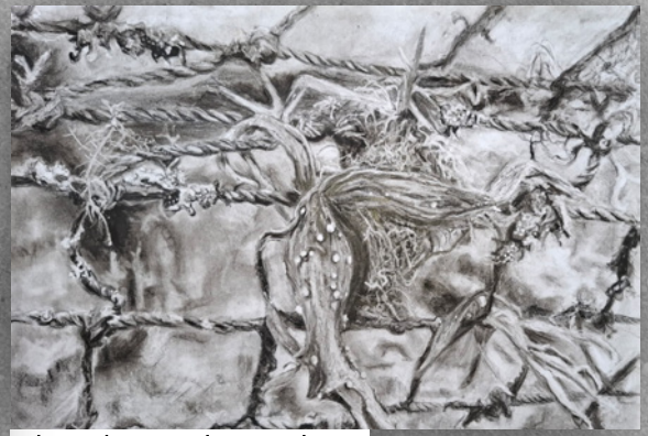
Abigail Fair, Charcoal A3