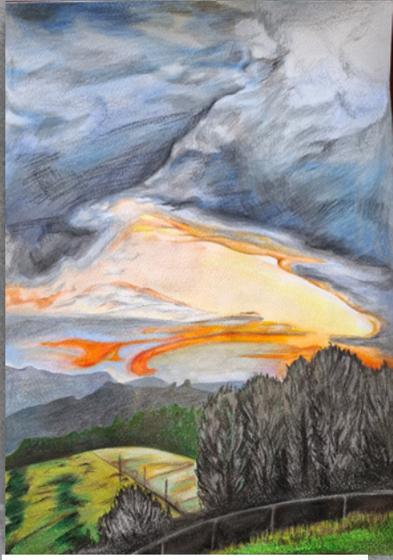
Nsovo Mabila, colour pencils A3