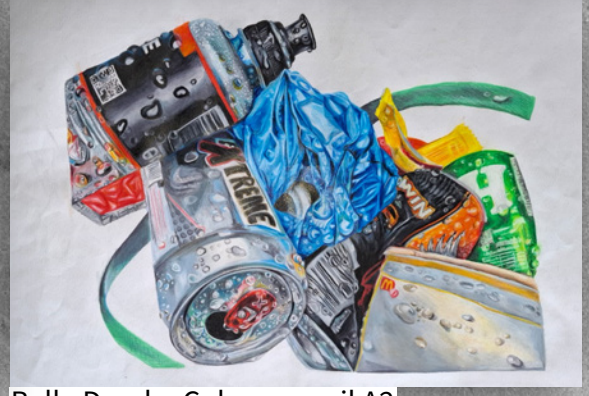
Bella Dando. Colour pencil A2

For their PAT Task 1 drawings, the Matric students explored the theme 'Secrets and Surprises' through perceptual drawing, translating their discoveries into artwork. Each student approached the theme uniquely, using various mediums and techniques to reveal hidden meanings, symbolism, or unexpected perspectives. The emphasis on perceptual drawing requires a keen eye for detail and observation, pushing students to refine their technical skills while embedding their works with personal or conceptual depth. Through this, they not only honed their artistic abilities but also uncovered new ways of visually communicating the unseen and the unexpected.