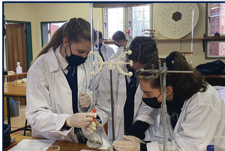
Grade 11 Titration Practical.